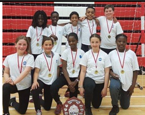
The team with the winner's shield!

Huge congratulations to the Year 5 Handball team who were declared the Islington champions this week at games on Tuesday. They made the school very proud. A full match report will be in next week's newsletter!