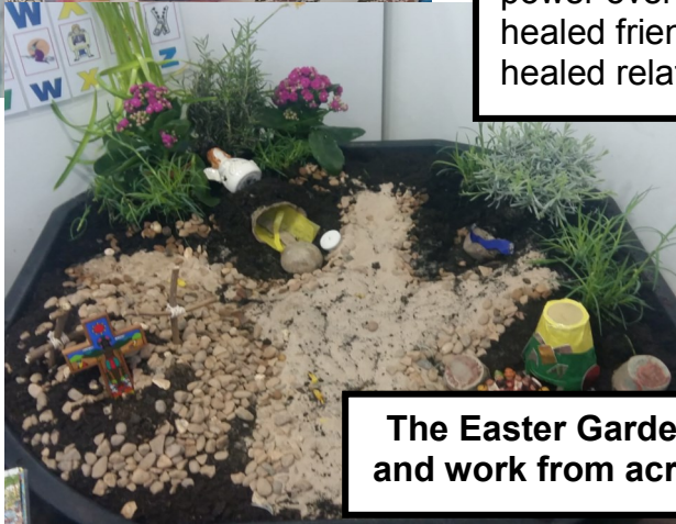
The Easter Garden in the library and work from across the school.