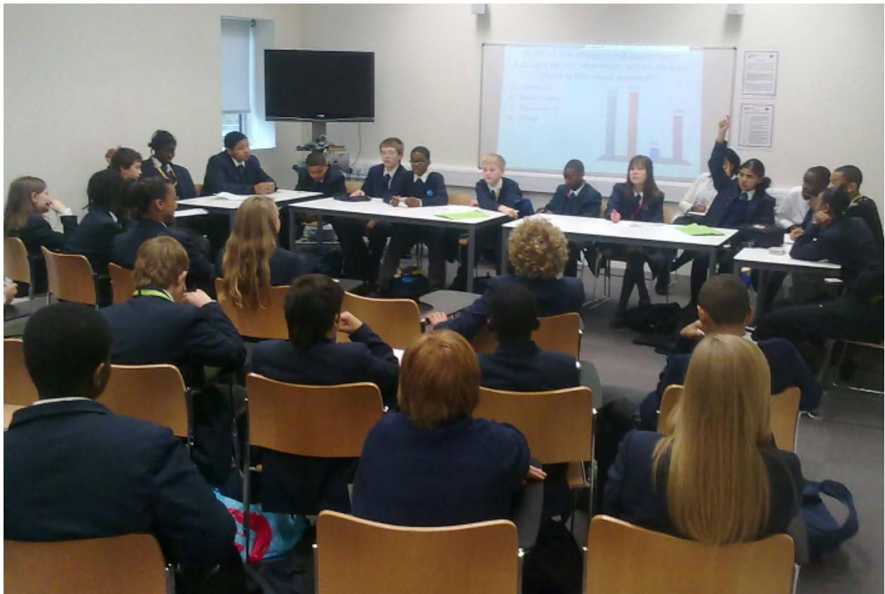
The cabinet sat at the front as the MPs voiced their views.